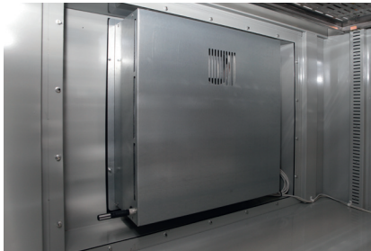
Dry Unit U 5001